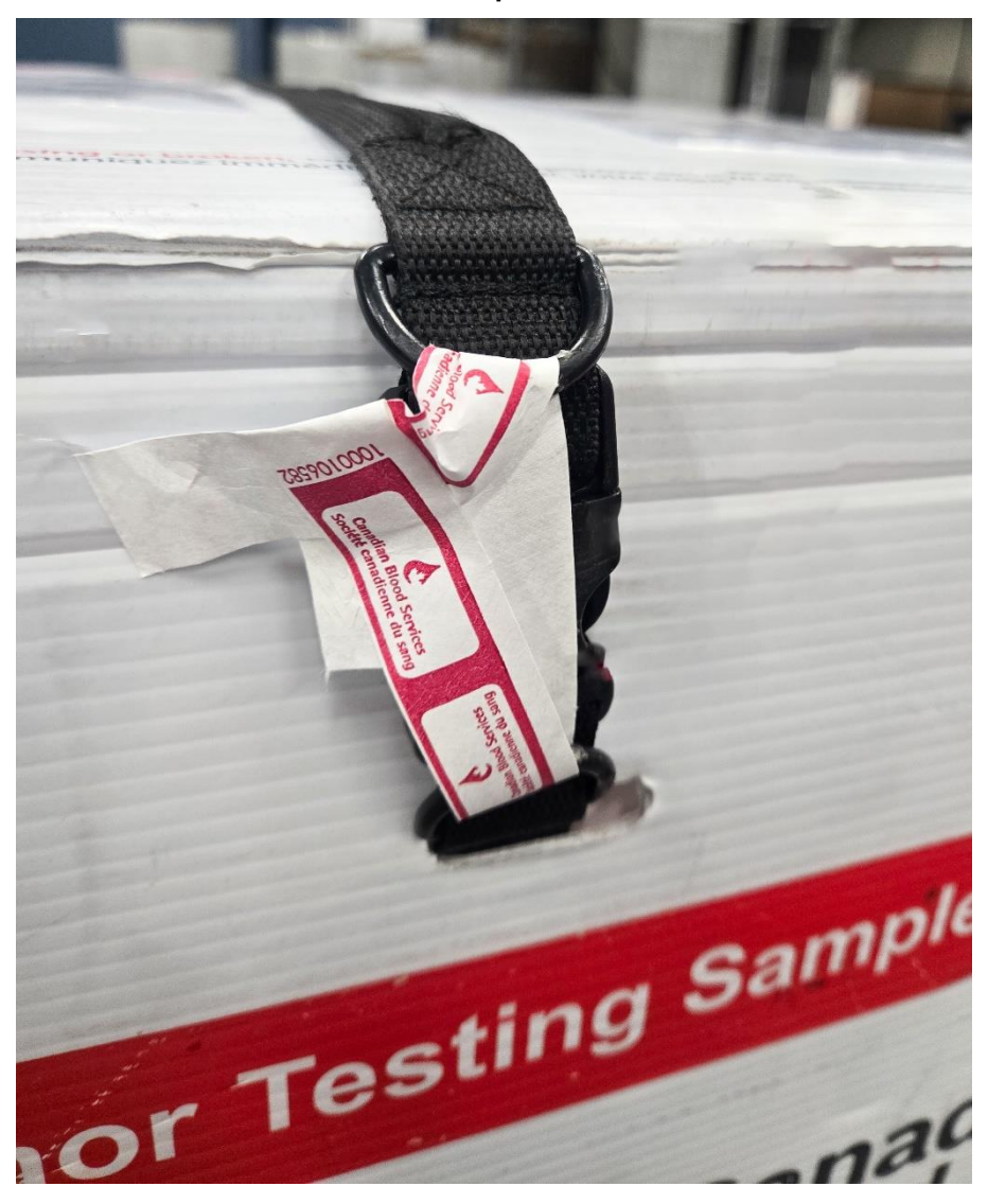
Attachment 2: Current Tamper Indication Device Photo

Black buckle strap with a current the Tyvek wrist-band device attached to a Canadian Blood Services Box